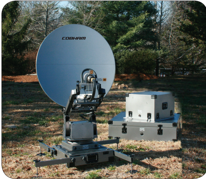
EXPLORER 5120 Fly-Away Configuration

The most important thing we build is trust